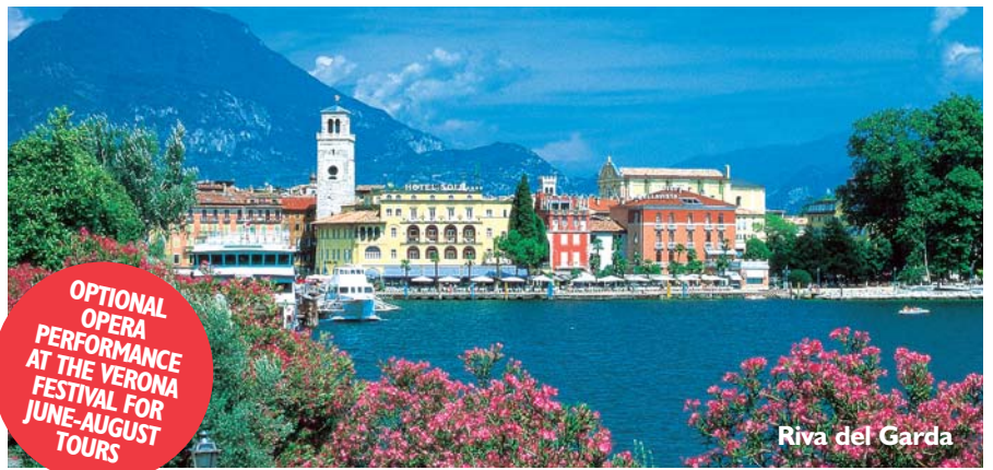
Riva del Garda

23 June, 25 June, 2 July, 9 July, 23 August, 1 September & 8 September 2010